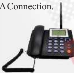
FCP with SIM Card Inside. FCP has No Out Ports as in FCT

SIM Card can be inserted into an FCP, and it becomes a Normal land line looking Phone With a GSM / CDMA Connection.